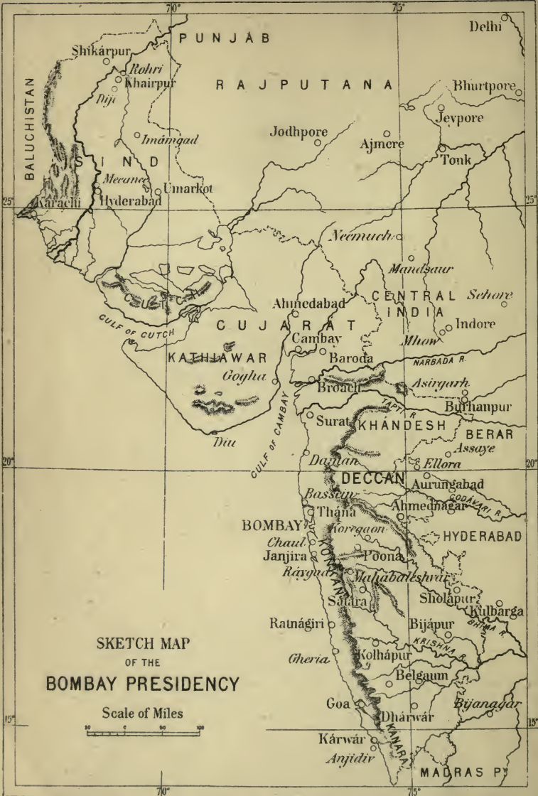
SKETCH MAP OF THE BOMBAY PRESIDENCY